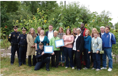
Hopkins police in partnership with neighbors, school district staff, business leaders, local & national civic organizations, city community development staff, and elected officials at the Cottageville neighborhood garden celebration

Hopkins police are fortunate to have incredibly strong and trusting relationships with many stakeholders in the community including; schools, faith leaders, civic groups, business owners, property managers, and incredibly dedicated residents in neighborhoods.