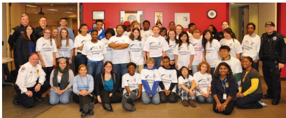
2011 Youth Police Academy in partnership with the FBI, Hopkins School District, Hopkins Fire Fighters, Minnetonka Police and the awesome youth from Hopkins as part of the Joint Community Police Partnership (JCPP)

FOCUS Unit, Crime Assessment & Planning Meetings (CAP), Nuisance Property Program, Juvenile Probation Partnership, Roll Call/Department Trainings, Joint Community Police Partnership